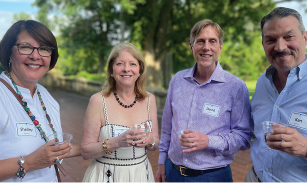
Our second annual Summer Soirée was held at Waveny House on June 6, 2024. Generous sponsors ensured a successful event.

Save the date for next year – June 5, 2025!